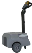
Tow package and a tugger

https://www.youtube.com/watch?v=INlzJKdLRk