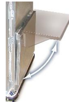
Fold down exterior shelf