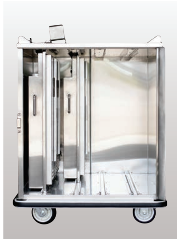
spare heater cabinets holds 8 spare heaters