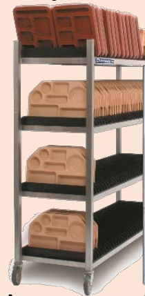
Sheet pan dry rack