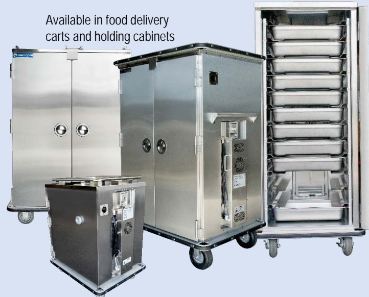
Available in food delivery carts and holding cabinets