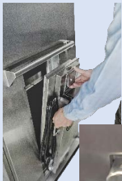
Simple slam latch key lock matched to cart fleet