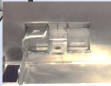
Optional locking mechanism for use with padlocks